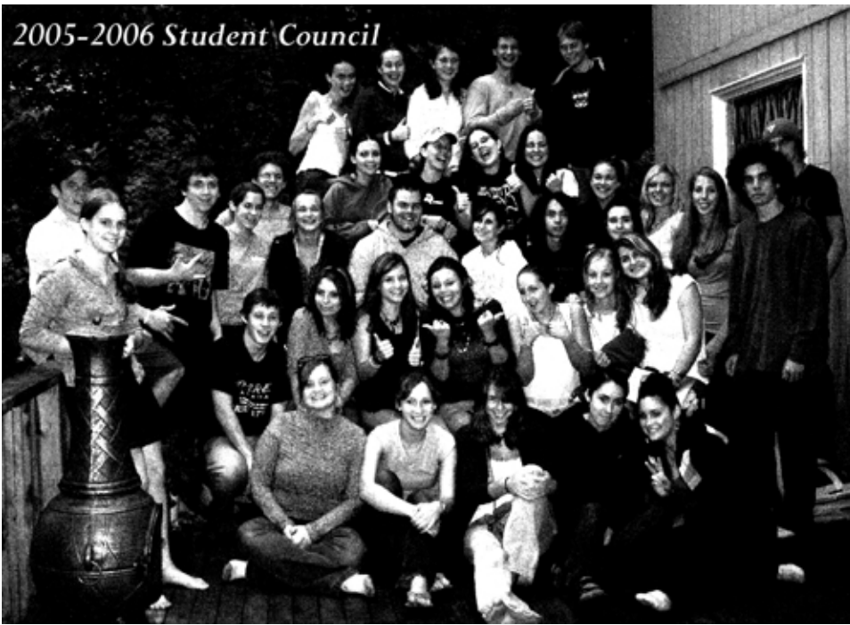
2005-2006 Student Council

September 2005- Special Ninth Grade Edition